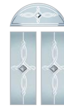
Gavalas (S) or (G) Double-glazed