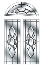
Spirit† (L) Double-glazed