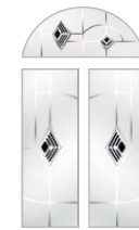
Murano† Double-glazed Available in Red (with Yellow insert), Blue (with light Blue insert), Green (with light Green insert) and Black (with Black insert)