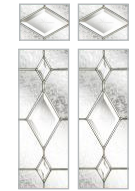
Kara (G) or (S) Triple-glazed