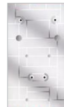
Eos† Double-glazed Available in Red, Blue, Green and Black