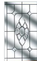
Spirit† (L) Double-glazed Available in Clear, Red, Blue, Green and Black