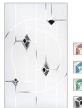
Murano† Double-glazed Available in Red (with Yellow insert), Blue (with light Blue insert), Green (with light Green insert) and Black (with Black insert)